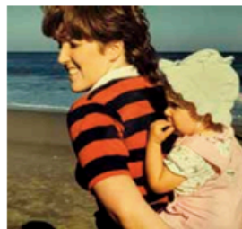
A lifelong love for the beach—thanks to Mom, who taught me young.

The name Our Mother's Stewards is powerful. What's the story behind it? The name is a tribute on multiple levels. "Mother" refers to both Mother Earth and my mom. Her maiden name was Stewart—Scottish for "steward"—which ties into the idea that we are all caretakers of our environment. It felt deeply symbolic and perfectly aligned with our mission. Starting a nonprofit is no small feat. What was the first step? We began with community beach cleanups in 2018, thanks to support from St. Johns County Parks and Recreation. As participation grew, we formalized as an LLC called Clean Sweep in 2021. In 2023, we rebranded as Our Mother's Stewards and achieved nonprofit status.